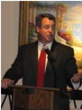
George F. Gansler

Our section Fellows were very well represented in the ADA's Give Kids a Smile Day in February, and on May 2, 2012 the DC Chapter and the Metropolitan section of the American College of Dentists had a combined dinner meeting. The speaker was Mr. George F. Gansler, the Attorney General of Maryland, who discussed the current controversies of DNA testing in violent criminals and the banning of arsenic in chicken feed. We invited the dental student from Howard University who received the ICD Award and acknowledged the accomplishments.